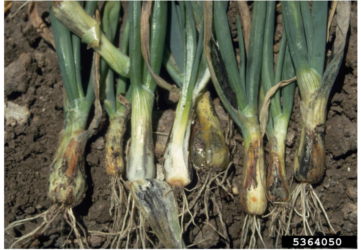
Figure 2. Symptoms of onion smut.

In eastern areas of the U. S., where disease and insect pressures are high, treatment with FarMore® FI500 can be useful. FarMore® FI500 contains the same mix of fungicides found in FarMore® 300 plus the insecticides Regard® and Cruiser®. These insecticides are especially helpful in areas where the insects have developed resistance to previously used insecticides. Cruiser®, in particular, is useful because it can systemically control additional pests, such as aphids, onion thrips, and wireworms. Please note that this seed treatment combination is currently only available in the U. S. and cannot be sold to growers and customers in Canada.