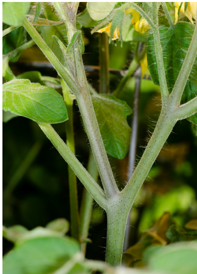
Figure 2. Large suckers should be removed with a sharp knife or shears to avoid the tearing of tissues.

Pruning is typically done four to five weeks after transplanting. Pruning just prior to the first stringing, in a stake-and-weave system, simplifies the process of accessing and removing suckers. Suckers should be removed when they are two to four inches long. Removing larger suckers, thicker than a pencil (Figure 2), will leave large wounds that are slow to heal and can be sites for infection by pathogens. 1,3 Plants should be pruned when they are dry (no free-moisture on plant surfaces) to minimize the spread of foliar diseases such as bacterial spot.