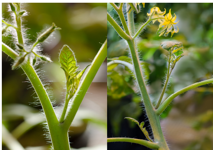
Figure 1. Axillary shoots, or suckers, emerge from the leaf axil, where the leaf petiole meets the stem.

The pruning of tomatoes involves the removal of axillary shoots, commonly known as suckers, usually from the lower part of the plant. Suckers develop from the axil, where the leaf petiole meets the stem, forming at each leaf node (Figure 1). If not removed, the suckers will develop into shoots that produce leaves and fruit. The additional foliage and fruit tissues compete with the rest of the plant for water, nutrients, and light, often resulting in more, but smaller fruit. 1 However, over-pruning, the removal of too many suckers, can reduce the yield of marketable fruit. The goal of pruning is to create an optimal balance of vegetative growth and fruit production. 2 Pruning can result in increased fruit size and increased earliness of the crown set. Less foliage also increases light penetration and air circulation in the lower canopy, which can reduce disease severity levels. 3