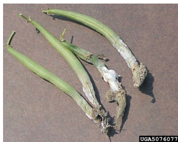
Figure 4. Bean pods showing signs and symptoms of aerial Pythium infection.

Partial resistance to aerial Pythium has been observed in some cultivars. It was hypothesized that bean varieties with a more upright habit and higher pod set would be less prone to infection and allow for better fungicide penetration into the canopy, but this was shown not to be the case.