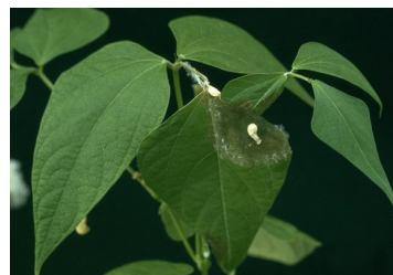
Figure 3. The white mold fungus uses the nutrients in fallen flower petals as a food source to support the infection of healthy plant tissues. University of Illinois Extension.

Resistance to white mold is available in very few varieties. However, upright varieties with more open canopies are usually less prone to severe levels of disease. Crop rotation to non-host