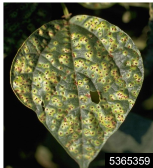
Figure 1. Bean rust pustules on a bean leaf.

Symptoms of bean rust include small, circular, reddish-brown pustules that develop primarily on leaves, but can also appear on stems, petioles, and pods (Figure 1). 1 As they mature, the pustules split open releasing masses of rust spores that are disseminated by wind and splashing rain. These spores can travel long distances in the wind.