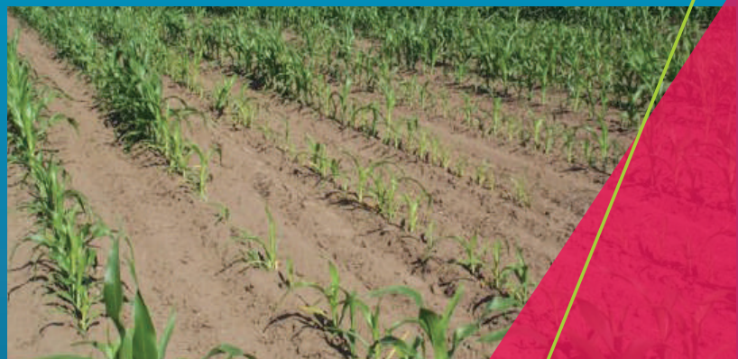
(Fig. 3 - Symptoms on maize).

The use of tolerant cultivars and non-hosts to target nematodes contribute significantly to reducing such pest populations. However, the traditional crop rotation systems applied in South African agricultural areas are conducive to the build-up of high numbers of target nematode pests such as root-knot and lesion nematodes. For example, crops such as potato, dry bean, soybean, sunflower, other vegetable crops (except some Brassicaceae cultivars) are highly susceptible to root-knot and lesion nematodes.