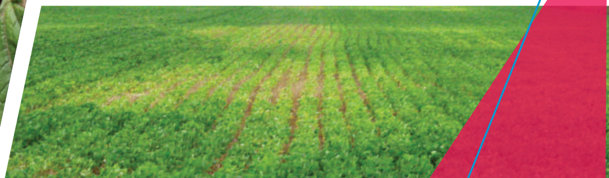
Fig. 1 - Symptoms on soybeans