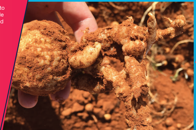
Fig. 2 - Symptoms of galls on potato