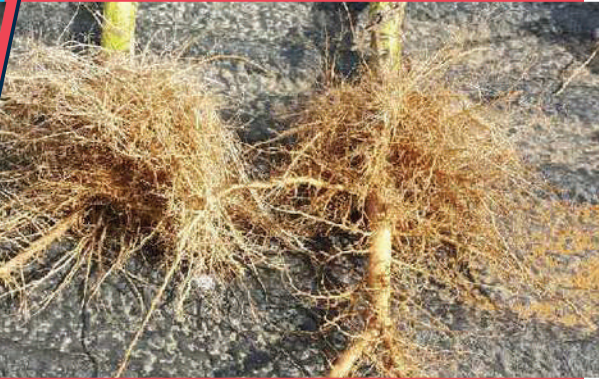
Resistant soybean cultivar